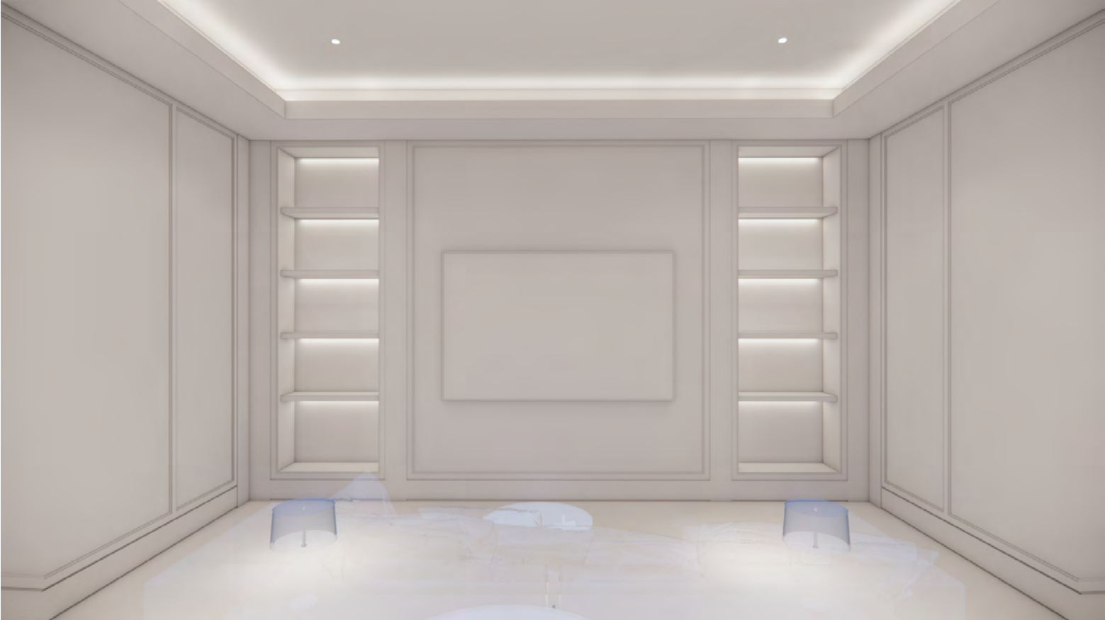
MAY 25 2022