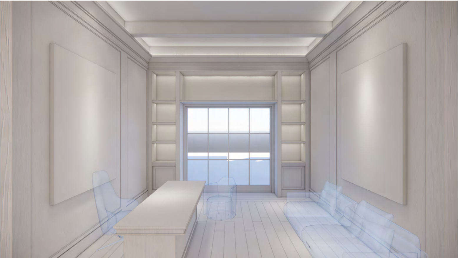
MAY 20 2022