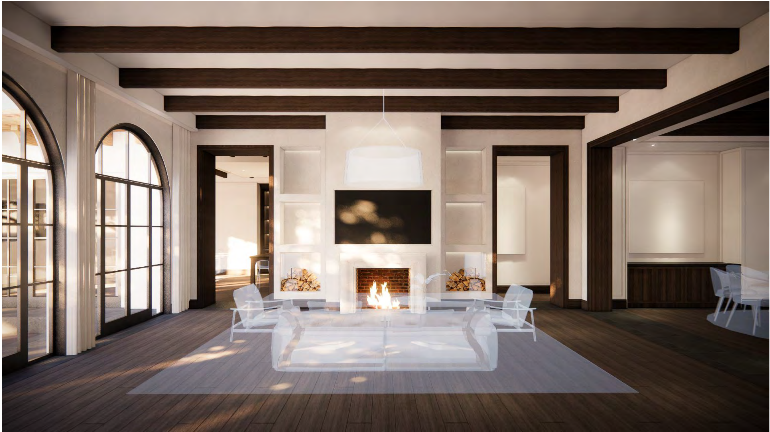
FIREPLACE - OPTION 1