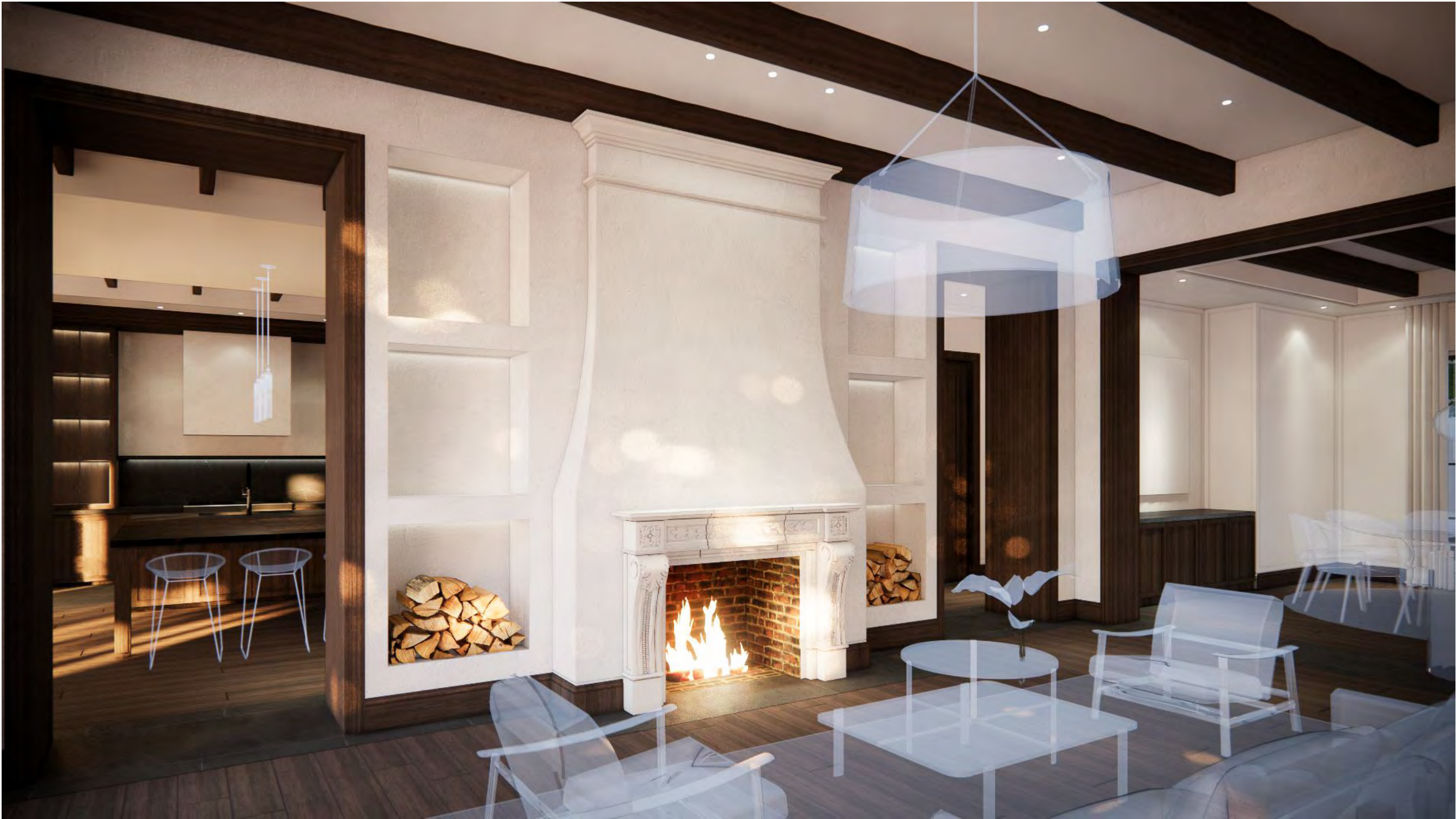
FIREPLACE - OPTION 2 (ALESSANDRO PREFERRED)