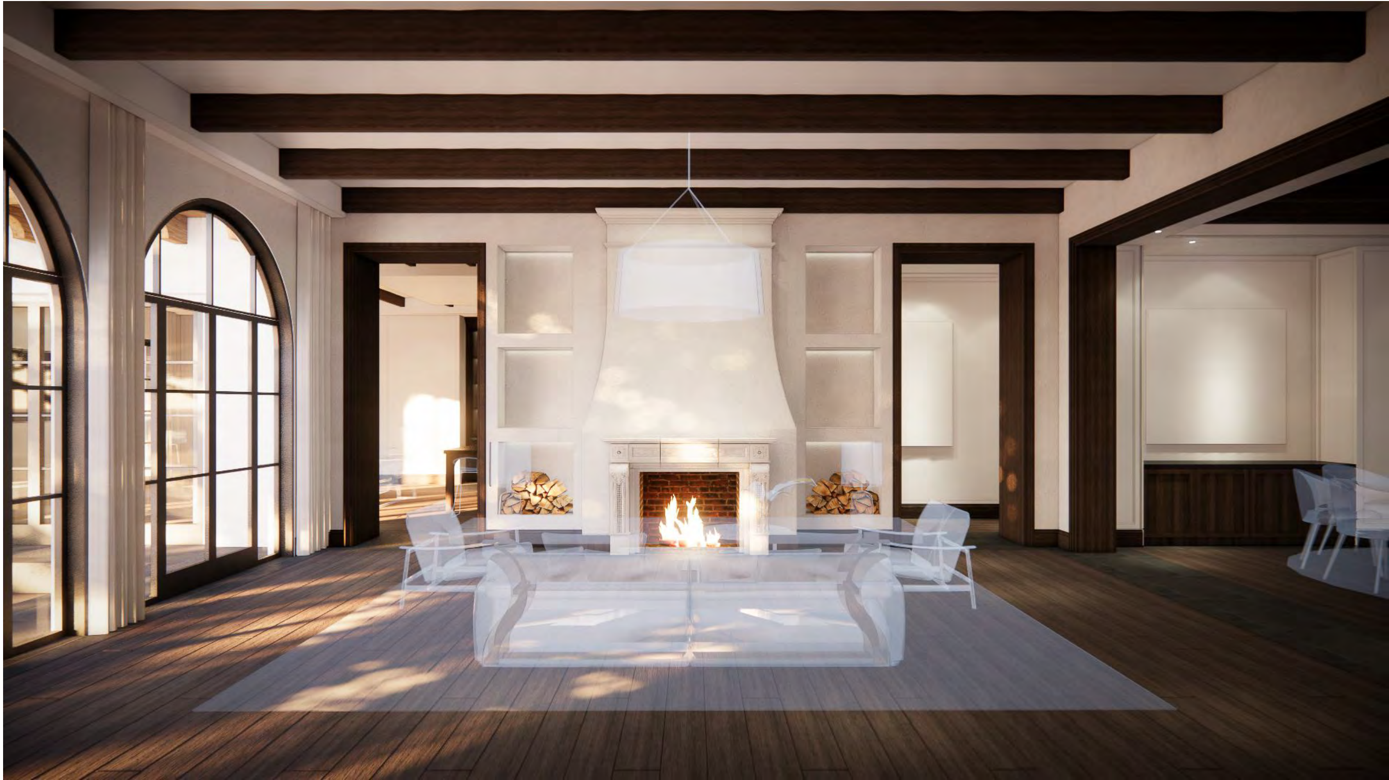
FIREPLACE - OPTION 2 (ALESSANDRO PREFERRED)