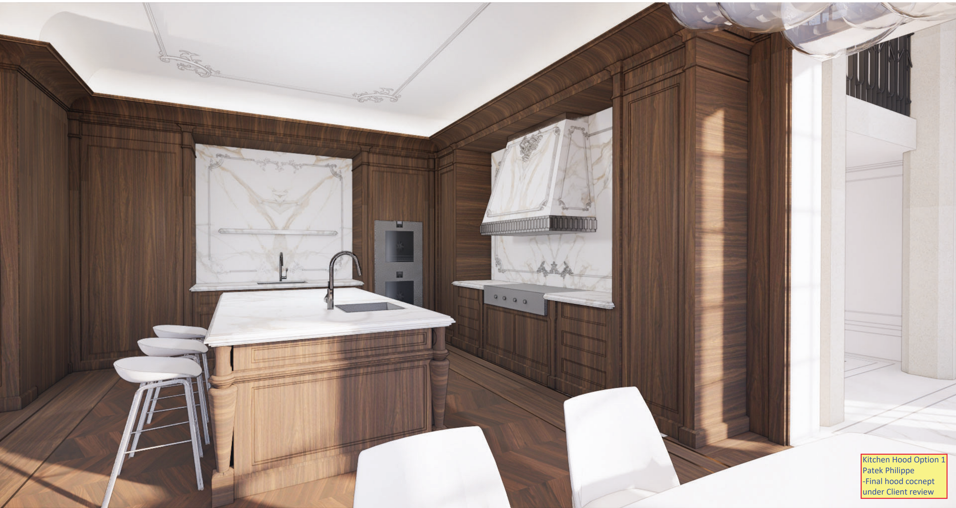
Kitchen Hood Option 1 Patek Philippe -Final hood cocnept under Client review