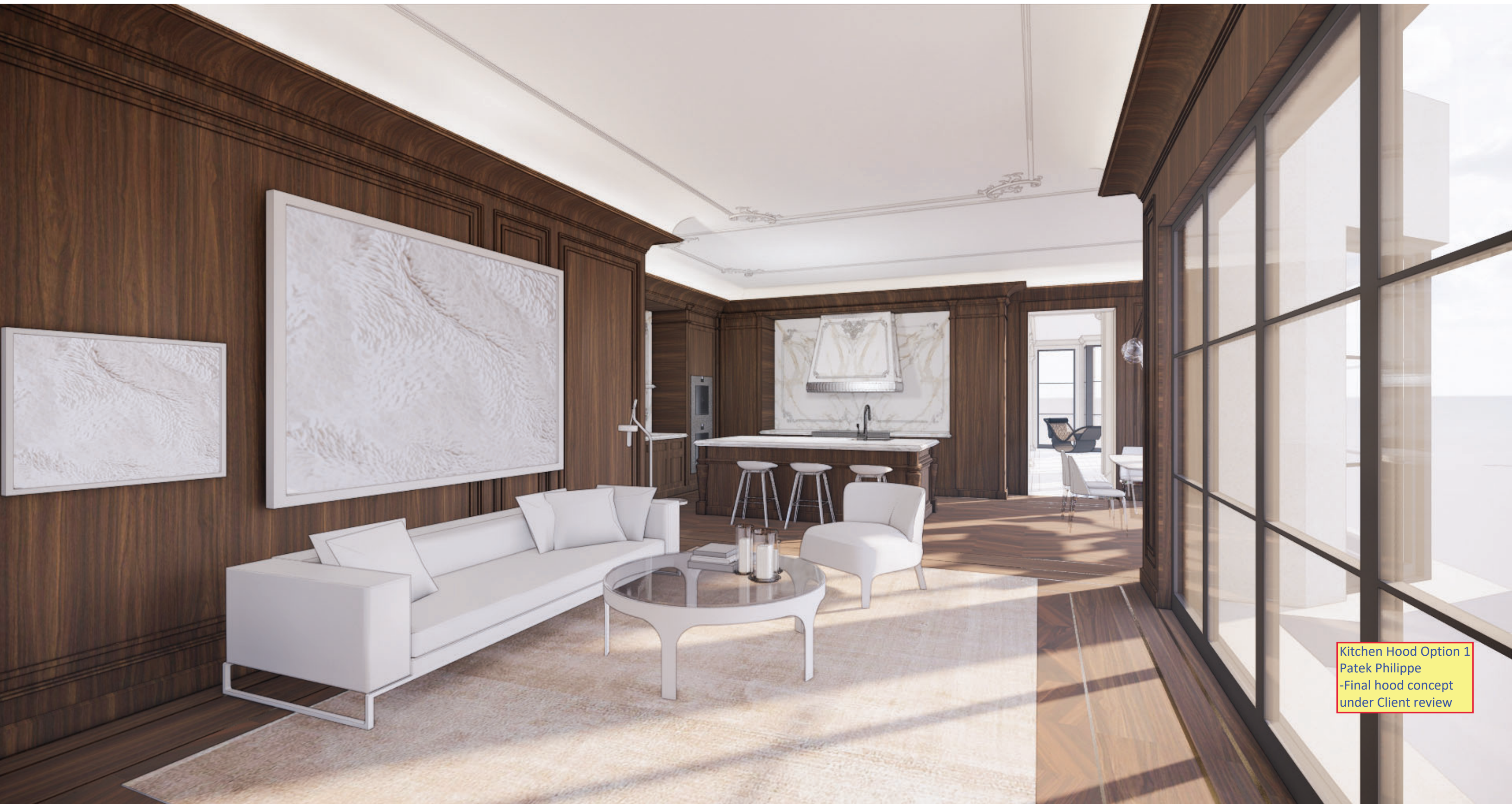
Kitchen Hood Option 1 Patek Philippe -Final hood concept under Client review