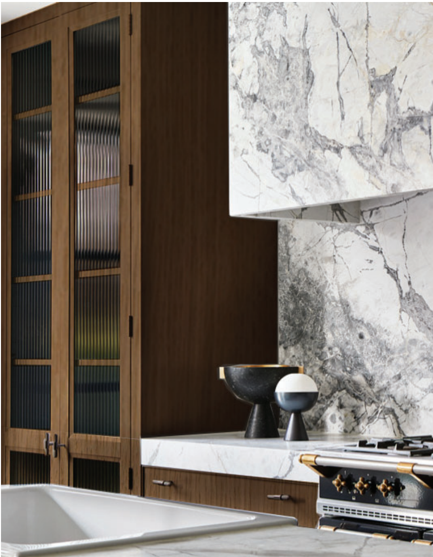
RICH WALNUT MILLWORK, CONTRASTED WITH A MODERN STONE HOOD