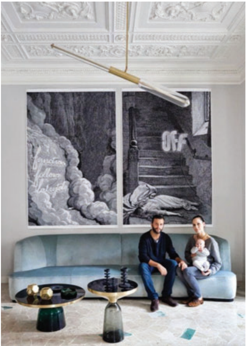
VIBRANT MIX OF FURNITURE