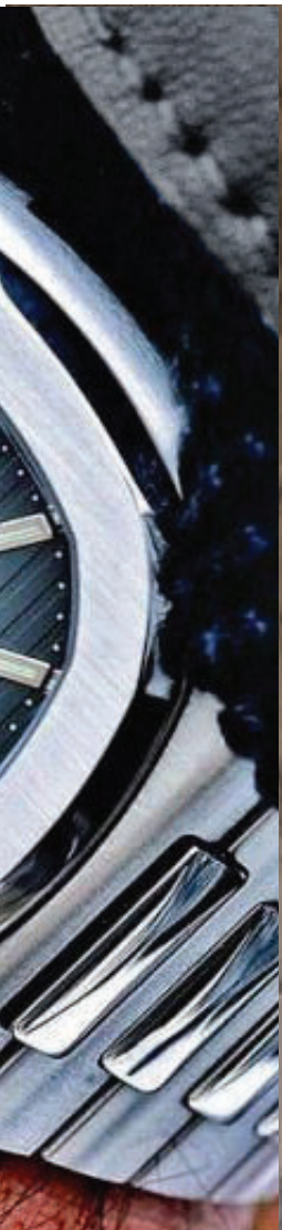
PATEK PHILIPPE METAL DETAIL ADORNES THE KITCHEN HOOD