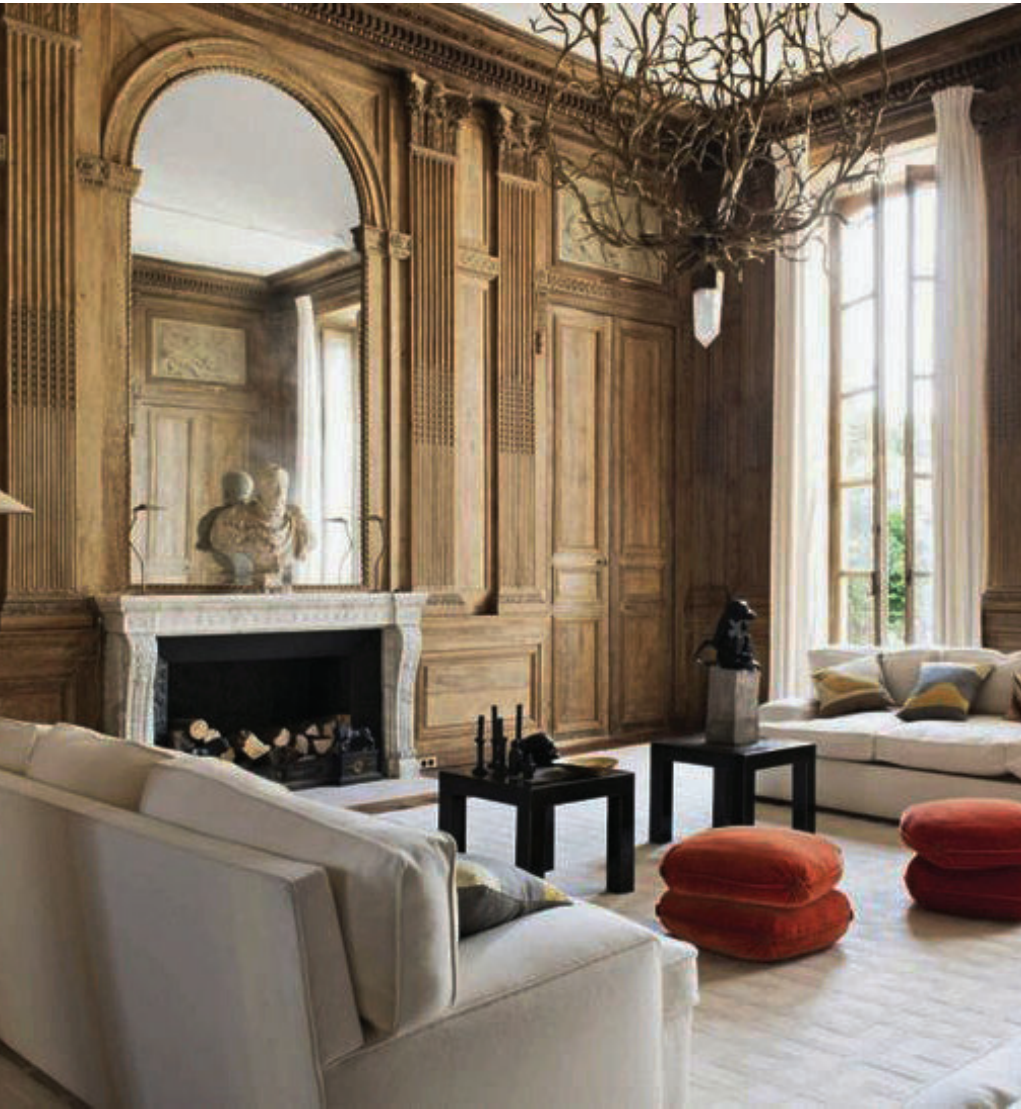
WOOD PANELING TO CREATE WARMTH