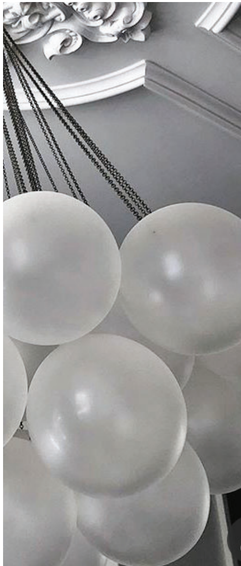
MODERN LIGHT FIXTURES