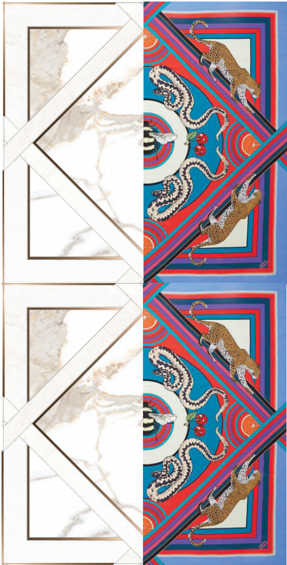
FLOOR PATTERN, INSPIRED BY A HERMÈS SCARF