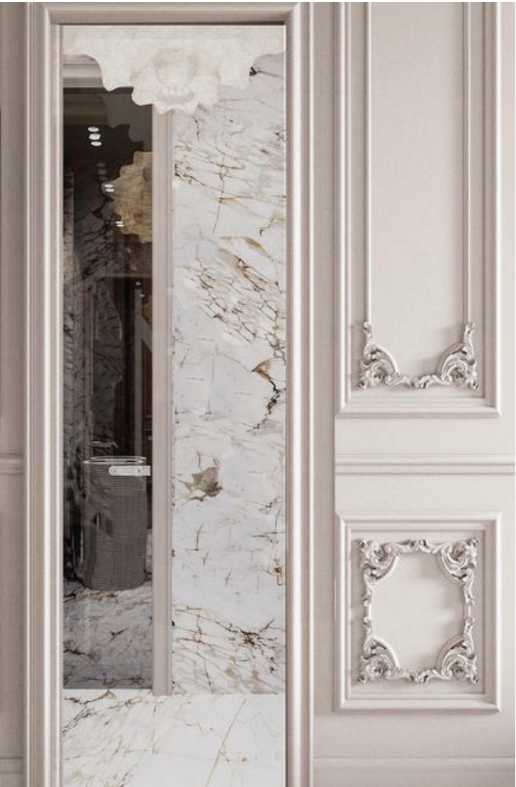
ORNATE PANELING GETS CONTRASTED WITH CLEAN STONE