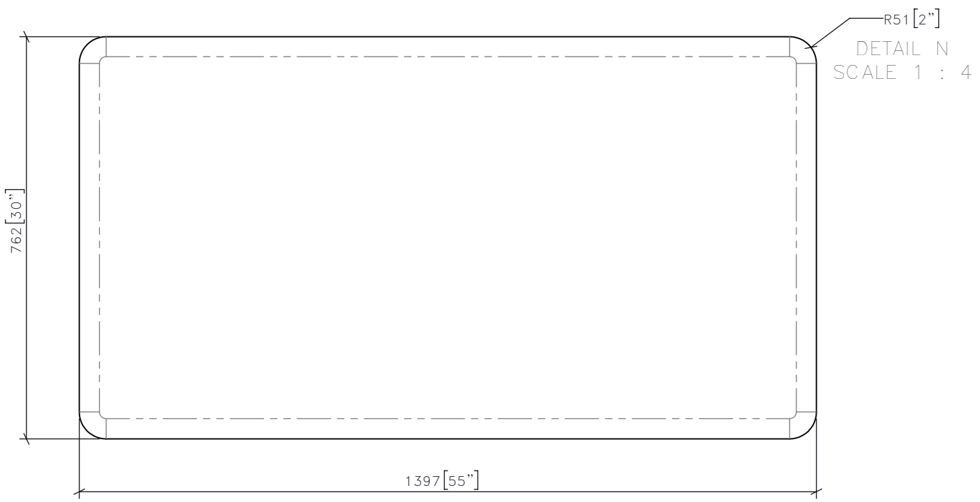
3 | FB-CG-04 | DINING TABLE 1:10 | PLAN

STUDIO MUNGE 25 WINGOLD AVENUE TORONTO, ONTARIO M6B 1P8 CANADA 416.588.1668 STUDIOMUNGE.COM