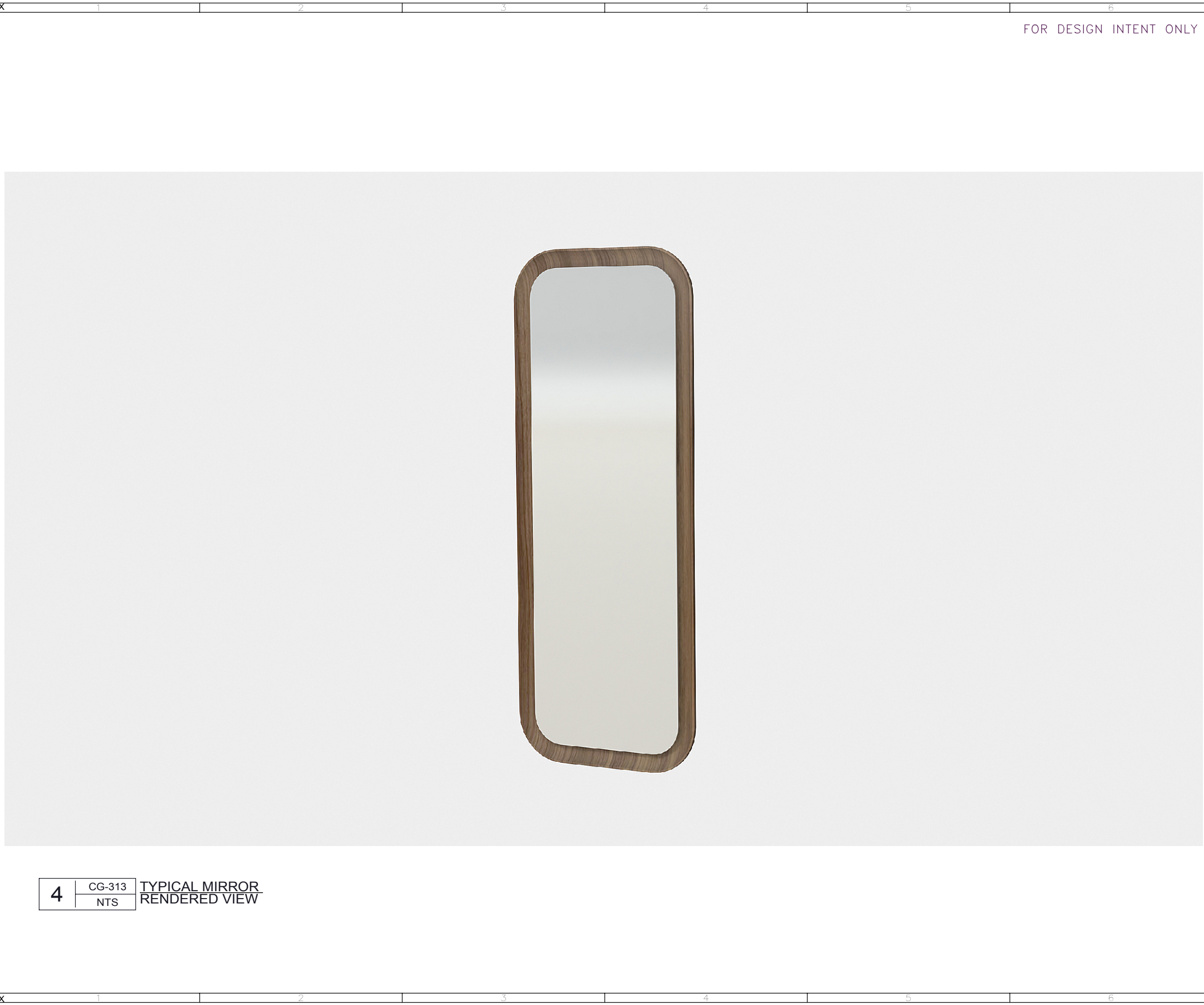
4 CG-313 TYPICAL MIRROR RENDERED VIEW NTS